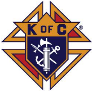
SK Tom Villardi Grand Knight